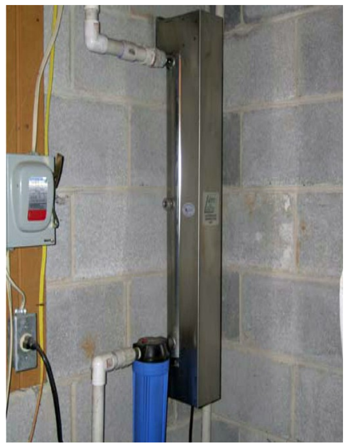
Figure 2. A typical UV light installation with a small canister sediment filter (bottom) ahead of the UV light unit.

The unit consists of a UV light bulb encased by a quartz glass sleeve (Figure 2). Water is irradiated with UV light as it flows over the glass sleeve. The untreated water entering the unit must be completely clear and free from any suspended sediment or turbidity to allow all of the bacteria to be irradiated by the light. A sediment filter is often installed ahead of the UV unit to remove any sediment or organic matter before it enters the unit. The quartz glass sleeve must also be kept free of any film. Overnight cleaning solutions can be used to keep the glass sleeve clean, or optional wipers can be purchased with the unit to manually clean the glass. Water with a high hardness (calcium and magnesium) may also coat the sleeve with scale (a whitish deposit of hardness), which may require routine cleaning or addition of a water softener. The unit also requires electricity and will cause a small but noticeable increase in your electric bill (perhaps $2 to $4 per month).